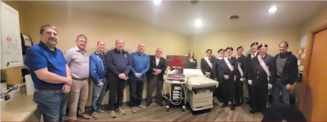
ULTRASOUND MACHINE BLESSING @ NEWTON FAMILY LIFE CENTER