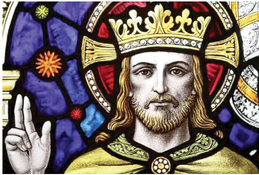
King of the Universe

November 25-26, 2023 Our Lord Jesus Christ,